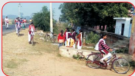
Bicycles given to girls in 9th & 10th standard under Mukhya Mantri Balika Cycle Yojna Modnarayan School, Amba Panchayat, Shakhund