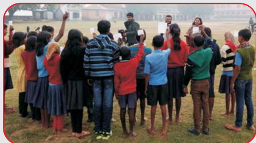
Student bank account being opened for direct benefit transfer of scholarship / uniform amount Modnarayan School, Amba Panchayat, Shakhund