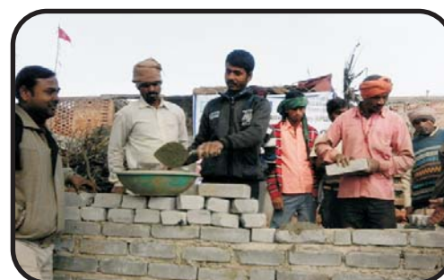
Masons being trained