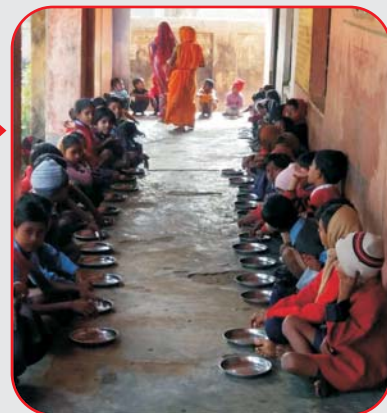
Followed by mid day meal