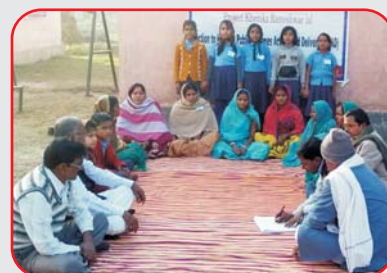
SMC Meeting at P.S. Dohradih Dindyalpur Panchayat, Shakhund Block