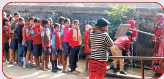
Sanitation Campaign in P.S Dohradih, Dindyalpur Panchayat, Shakhund Block