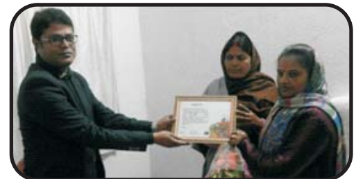
Our Project Coordinator along with Mukhiya and Pramukh, Kahalgaon