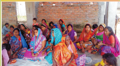
Advocacy group, Baluchak Panchayat, Jagdishpur

(This column features positive & impactful initiatives contributing to the success of the AIPAD Program)