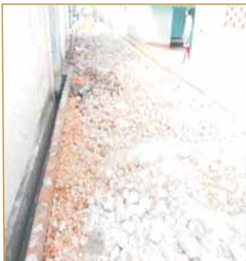
The newly construed drain in Kisanpur Amkhoriya Panchayat