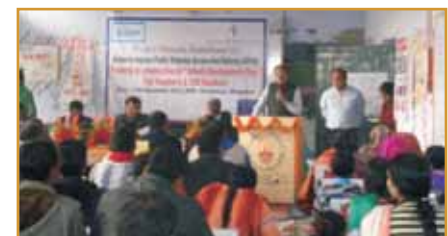
Principal of DIET addressing the VSS members