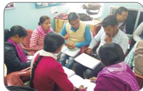
Our team participating in the SDP training programme