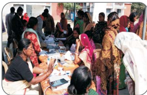
Health camps using health cube device on PMSMA day

AIPAD team conducted health camps using the health cube device on 9th February 2018 in the PHC Shahkund and Pirpanti. Trained ANMs along with technical support Engineers of Health Cube were present in the camps. The overall process of ANC check ups has changed with the usage of health cube during PMSMA days. In a normal ANC check up at AWCs or on a PMSMA day, only basic tests such as weight and blood pressure are conducted by a single ANM, which not only takes a lot of time but also fails at the objective of identifying high risk pregnancies. NHM recommended tests such as HIV, syphilis, Haemoglobin etc are hardly ever conducted that leads to higher numbers of maternal deaths. Many a times, patients are left undiagnosed due to availability of a single