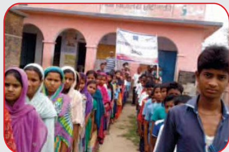
Enrollment drive at M.S. Chhoti Naki, Sanhoula