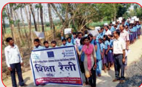
Shiksha Rally M.S. Kamalpur, Hajipur, Panchayat, Shahkund