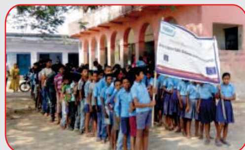
Shiksha rally at M.S. Tadar, Sanhoula