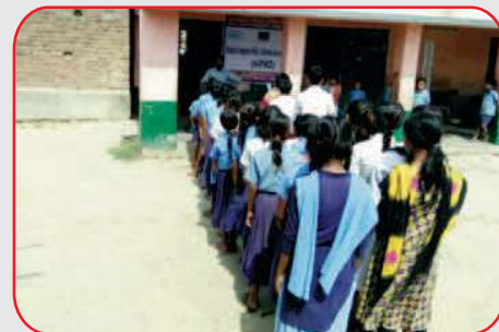
Enrollment camp at M.S. Koritola, Jagdishpur