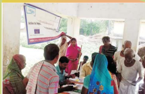
'Members of advocacy group during the E-Labharthi' camp'

(This column features positive & impactful initiatives contributing to the success of the AIPAD Program)