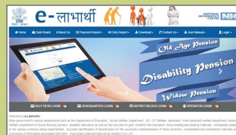
Snapshot of E-Labharthi

To know more about this application, click on the link http://elabharthi.bih.nic.in/