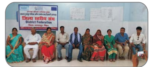
Members of District Federation

AIPAD has formulated, structured and strengthened community based institutions through the formation of village level advocacy groups and block level Kshetrayay Samitis. Advocacy groups have proved to be an effective way of strengthening the community and empowering them for their rights and entitlements. AIPAD team during the period of four years has been able to form 41 Advocacy Groups across all the five blocks. Similarly, Kshetrayay Samitis provide a platform at block level for resolving grievances. AIPAD has been